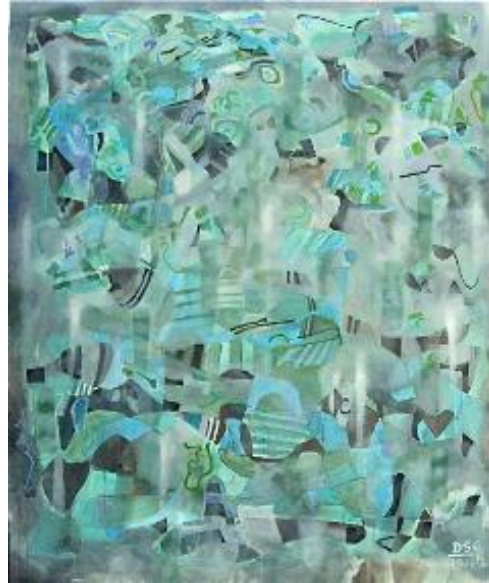
"Uncompromised Subtleties", 2010, oil on canvas, 72" x 60"

AT THE SAME TIME AND AT ANOTHER LEVEL...". PCC Conference on Technique,