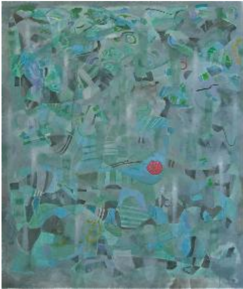
"Compromised Subtleties", 2010, oil on canvas, 72" x 60"